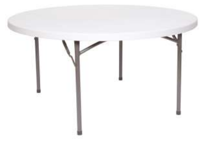
Banquet Table 6ft & 8ft $10