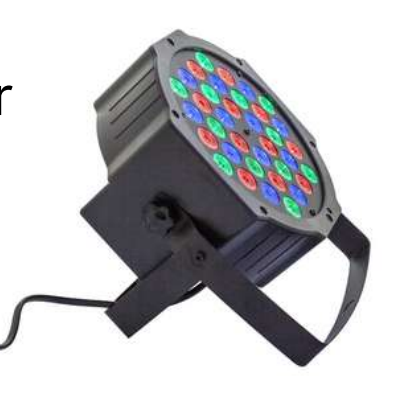
Multi-color Uplight $45