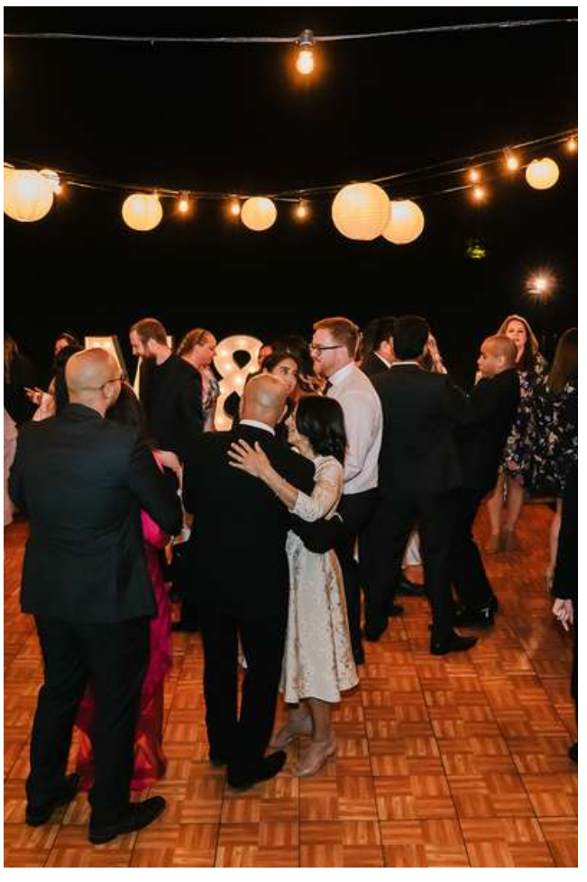
Smoked Oak *Most Popular*