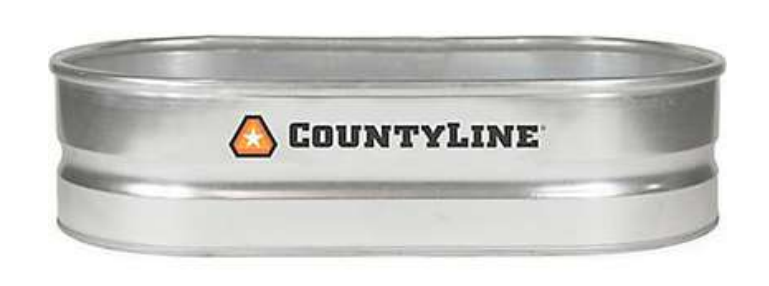
Water Trough $45