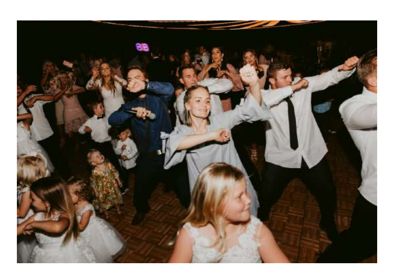
Includes: Professional DJ, sound equipment, itinerary tailored for your event.