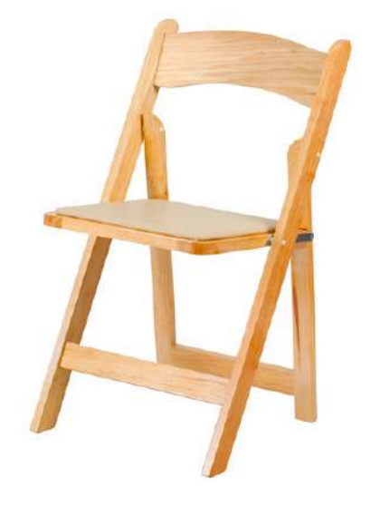
Natural Wood Chair