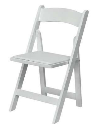
White Resin Chair