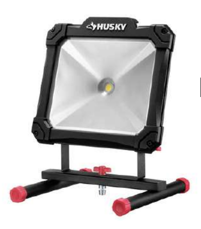
Flood Light $25