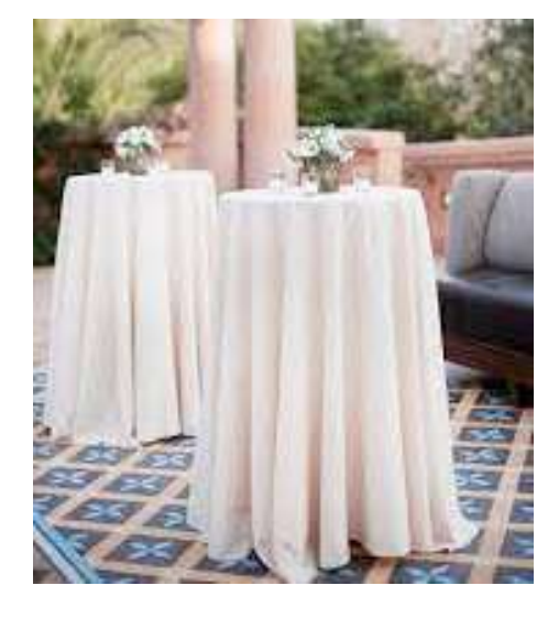
Cocktail Table $10