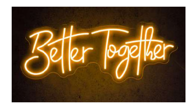
Better Together Neon Sign $100