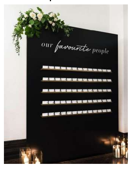
'Our Favorite People' Wall