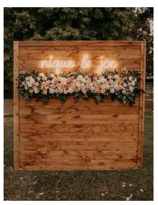
additional 4' sections - $100/each