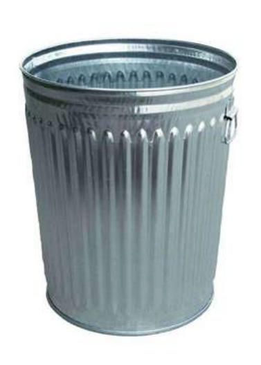
Trash Can $15